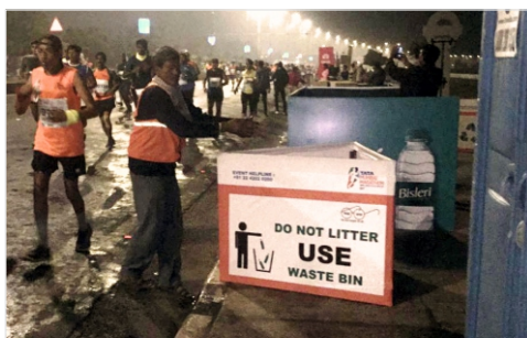
Route Waste Management

All efforts were taken to segregate the solid waste generated on all areas at source itself even as the event progressed. This reduced the waste disposal time by half, however, a final second level segregation was done at the MCGM common waste management facility at A ward.