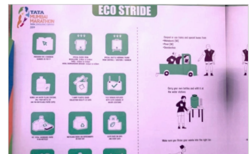
Eco Stride At Media Center