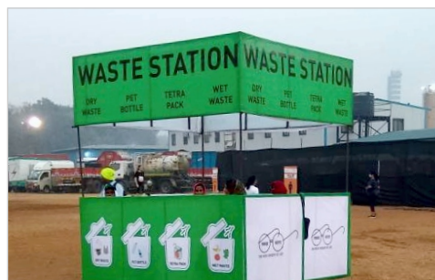
Waste Station On Grounds