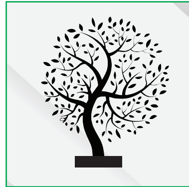
Saved 27.10 Trees by Recycling