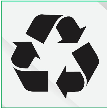
Recycled a Total 10.37 tons of Waste