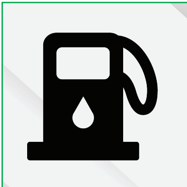
Saved 18.19 Liters of Fuel