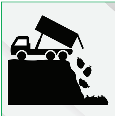
Landfill Area Saved 70.78 Cubic Meters